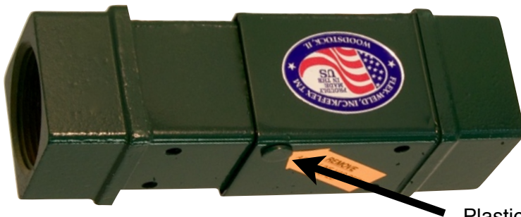
Plastic Set Pin (2 per unit on opposite sides of compensator)

Expansion compensators are not designed to absorb torsional movement or stress. Subjecting a compensator to torsion of any amount may drastically affect operating life and will void the warranty.